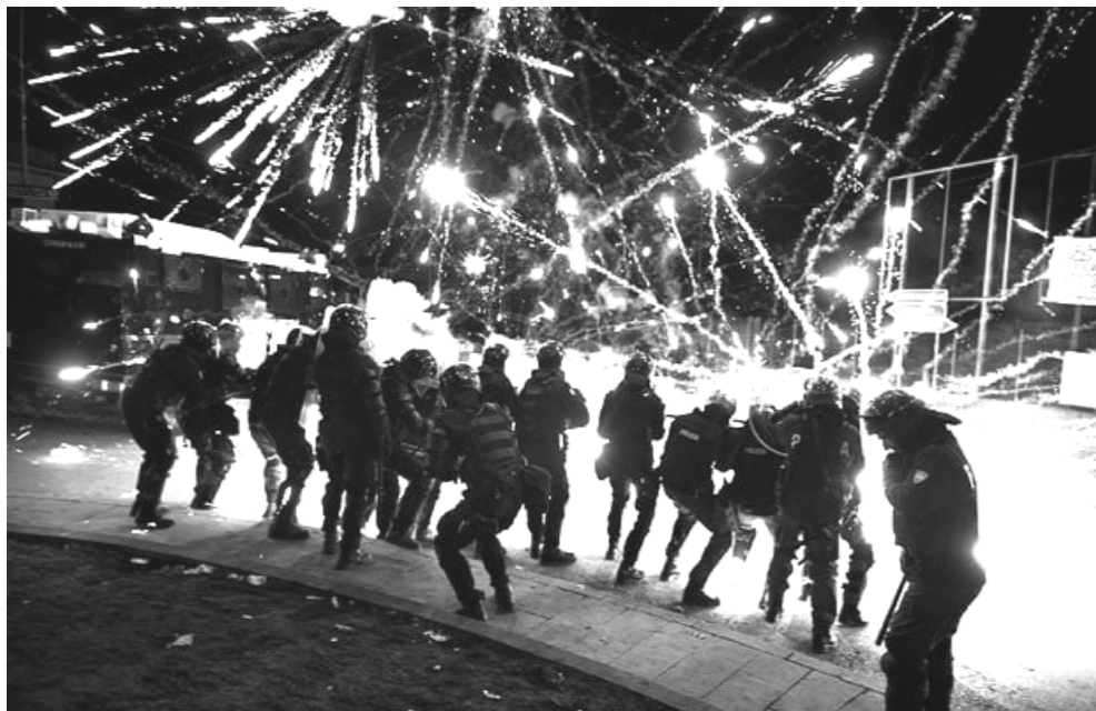
Perhaps justice can be achieved in more immediate and satisfying ways?

Context: On New Year's Eve 2018, a street party was held in central Copenhagen. At around 2 a.m., the cops showed up and acted very aggressively, swinging batons in every direction, and arrested several people, including a person who lost consciousness because of the brute force used. Apparently, there were no journalists present, and nothing was reported in the media. Following this disturbing event, the Anarchist Black Cross København [Copenhagen, ed.], in collaboration with other parties, has decided to pursue legal uprising through the courts, and has started collecting evidential material to be used against the police in a trial. The following commentary is a critical reaction to this overall strategy.