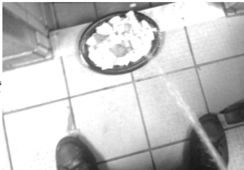
Piss with you dish, Sir?

Overall, a significantly sweet deal has been set up with all these foreign workers coming here to work. They do not complain, they have not brought their time-consuming and expensive families with them, and if they need to be fired, there is a line of eager like-